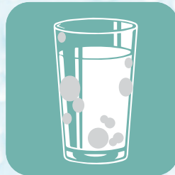
Spots on Dishes