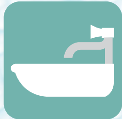
Stained Sinks and Tubs