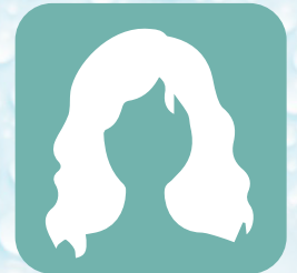
Dry, Brittle or Stained Hair